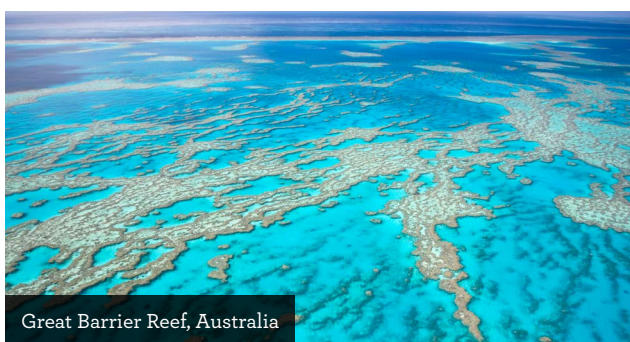
Great Barrier Reef, Australia