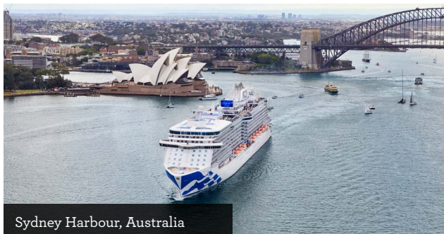
Sydney Harbour, Australia