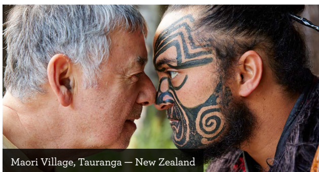
Maori Village, Tauranga — New Zealand