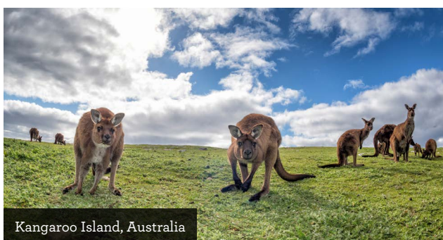
Kangaroo Island, Australia