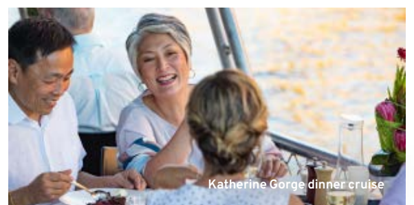
Katherine Gorge dinner cruise

🍷 Breakfast, lunch, Local Dining Experience