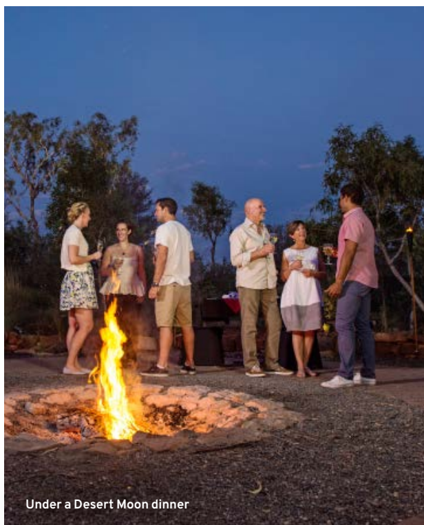
Under a Desert Moon dinner

🍽️ Breakfast, lunch, Local Dining Experience