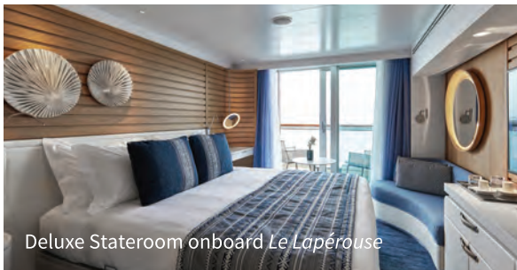
Deluxe Stateroom onboard Le Lapérouse