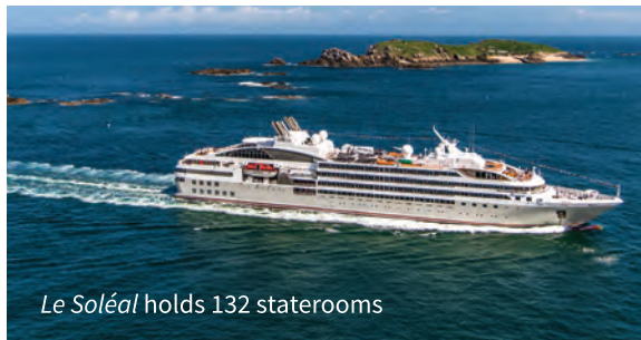
Le Soléal holds 132 staterooms