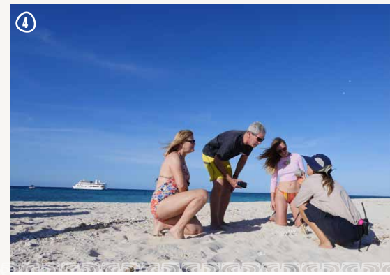
IMAGES 1 Sunset at Sudbury Cay | 2 Guided rainforest walks | 3 Scuba skills lesson, Lizard Island | 4 Beach interpretation with our marine biologist